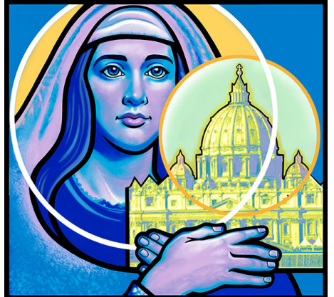
MOTHER OF THE CHURCH JUNE 1ST