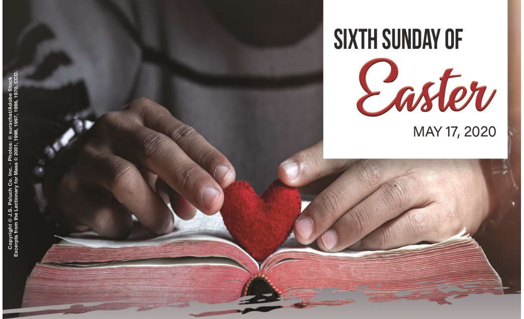
Copyright © J.S. Paluch Co. Inc. Excerpted from the Lectionary for Mass © 2001, 1998, 1997, 1986, 1970, CCD.

Jesus said, "If you love me you will keep my commandments."